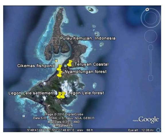
Figure 1. Karimunjawa island.

A total of 39 bird species from 19 families was observed in seven locations during the 3 days observation, 2 species of them are endemic in Java Island (Table 1). They are Dicaeum trochilleum (Sparrman, 1789) dan Lonchura leucogastroides (Horsfield &