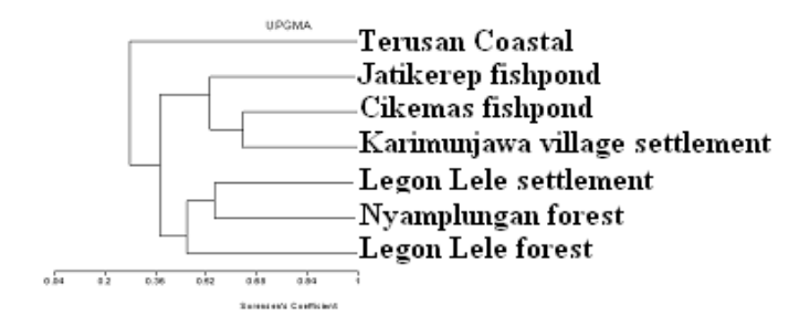
Figure 3. Dendrogram of Sorensen Similarity Index